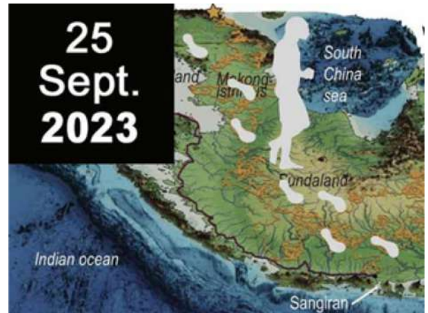
Preparatory workshop in 2023